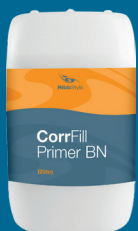
CorrFill Primer BN