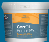
CorrFill Primer PA